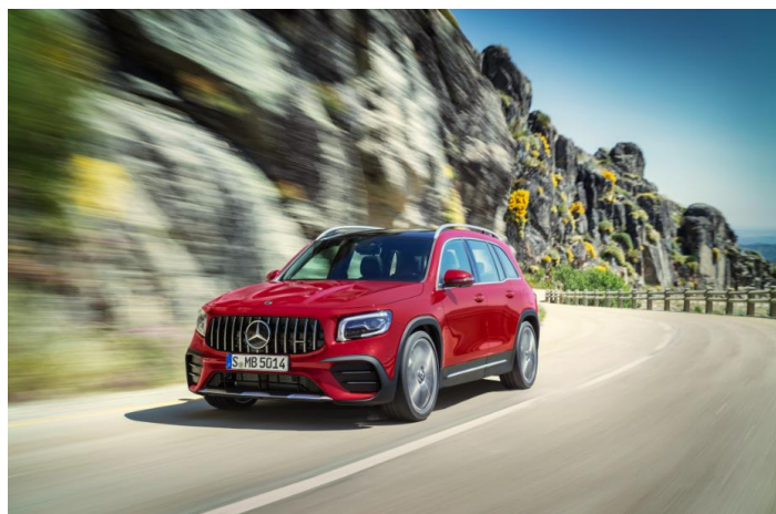
Mercedes-AMG's GLB 35 4MATIC

*The above photo is used with the permission of Mercedes-AMG. Reprint or other usage of this image without prior permission from Mercedes-AMG is strictly prohibited.